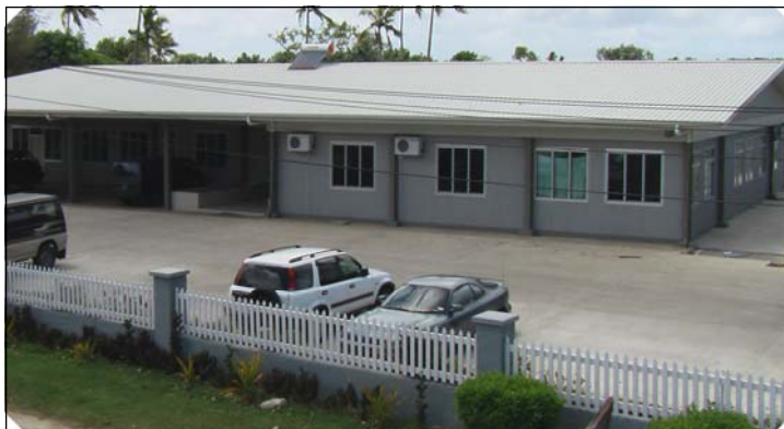
Ministry of Fisheries, Sopo