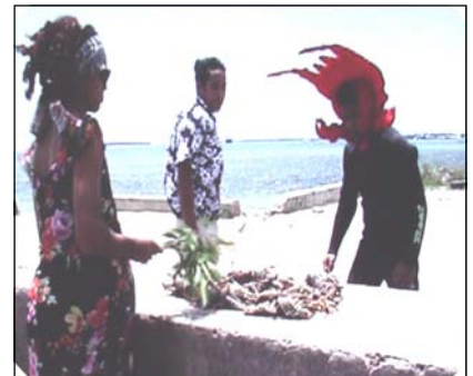
To'utupu 'o Veitongo 'i he 'enau fakatata'i e Lobsterman