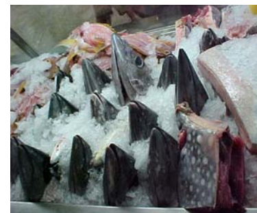
Ko hono fakatau atu 'eni he South Pacific Resource