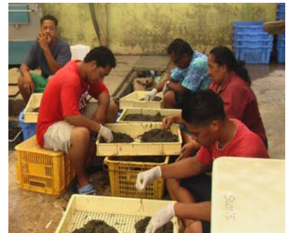
Ko e ngaue'anga limu 'eni 'a e Tangle Nano 'i Sopo