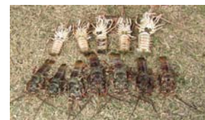
'Uo ta'efakalao na' e puke mai 'e he Potungae

local fish markets and restaurants are carried out as part of a rigorous compliance program to ensure that conservation objectives are achieved.