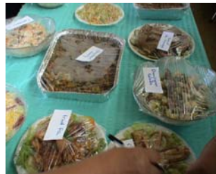
Ko e taha he me'atokoni mei tahi na' e kau ki he fe'auhi he 'Aho e Me'atokoni 'a Mamani 'i 'Eua

Food Day at 'Eua on the 14 th of October 2005, together with the farmers, fishers and the community of 'Eua. The World Food Day program include competitions in cooking seafood & local cuisine, aerobic, poetry citation and float exhibition.