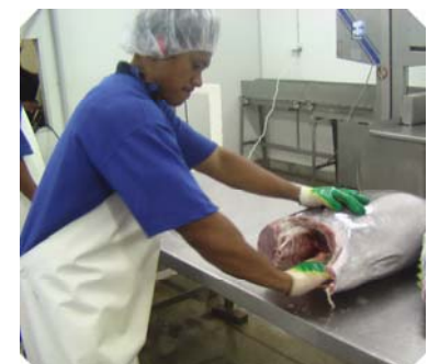
Ko teuteu'i e tuna 'a e 'Alatini Fisheries ke uta atu