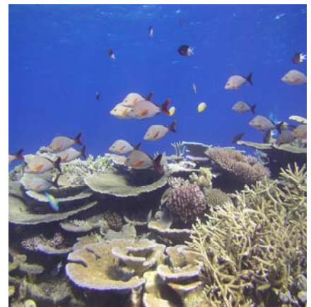
Ko e taha 'eni he ngaahi hakau 'i Tonga ni.

(ii) Teleki Tonga (South Minerva Reef) bounded by an arc 12m in length to delineate the territorial sea around Teleki Tonga measuring from the seaward low water line of the reef. The said reef positioned by the Royal Australian Survey Corps in 1981 on two reference points: 23 degree 56' 41.3931" S and 179 degree 08' 15.4517" W and the adjusted station at geographical coordinates 23 degrees 55' 46.7660" S and 179 degree 05' 33.7460" W.