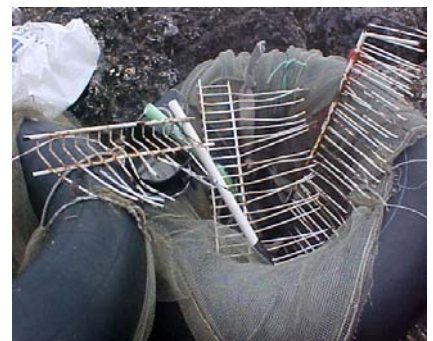
Ko e naunau toutai limu 'eni 'oku ngofua ke ngaue'aki