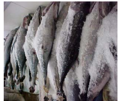
Ko hono faka'ai'ai 'eni 'o e Tuna 'o teuteu ke uta atu .