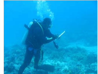
Tala'ofa Loto'ahea 'i hono savea'i e potu tahi 'o 'O'ua