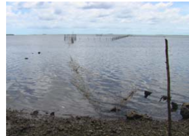
Ko e pa ika na'e ma'u 'oku nau ngaue'aki e kupenga 'o hoko 'aki e pa ika