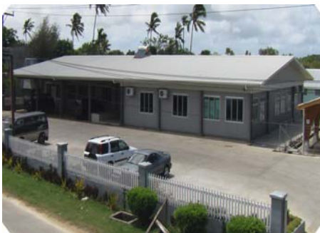
Ministry of Fisheries in Tonga

'Oku 'oatu e fakamalo lahi ki he tafa'aki ni he ikuna e polokalama ngaue ni.