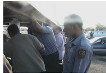
Ko e ngaahi 'ata mei he Inspection Week

One of the biggest achievements of the week accounted for involvement of restaurants, a rare occasion. Also awareness in the community, particularly fishers and buyers of fish have also been raised.