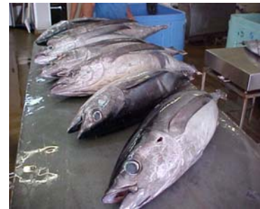
Teuteu'i e ngaahi fo'i 'Alapakoa ko 'ena ke uta atu ki tu'apule'anga

Despite the decline of tuna catch in recent years, the Tuna Management and Development Committee is optimistic that catches will slowly continue to rise. It also noted that companies have targeted yellow fin and big eye rather than albacore; and that locally foreign based vessels are not likely to be back to Tonga in the near future.