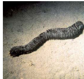
Holothuria coluber Snakefish (Te'epupulu)