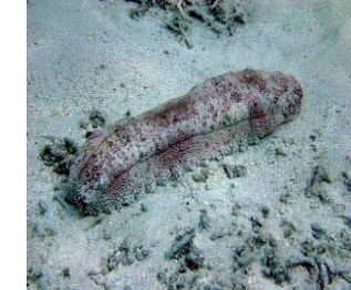
Thelenota anax Amberfish (Saieniti)