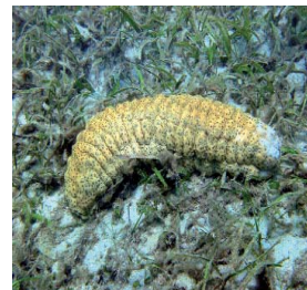
Stichopus herrmanni Curryfish (Lomu)