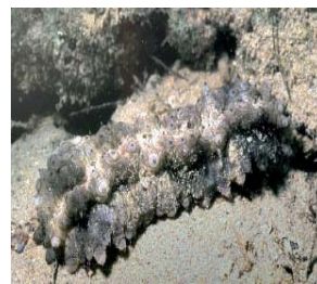
Stichopus horrens Dragonfish (Lomu)