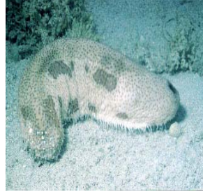
Bohadschia similis Chalkfish (Finemotu'a)