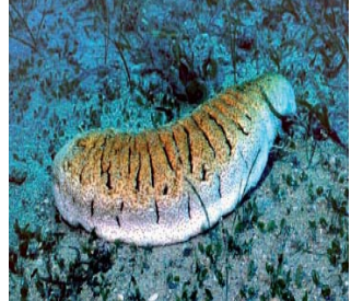
Holothuria fuscopunctata Elephant trunkfish ('Elifanite)