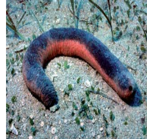
Holothuria edulis Pinkfish (Loli pingiki)