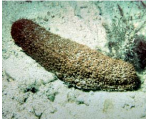
Actinopyga echinites Deep-water redfish Telehea loloto