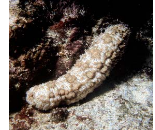
Pearsonothuria graeffei Flowerfish (Lomu matala)