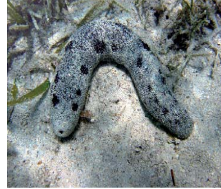
Holothuria atra Lollyfish Lollyfish (Loli)