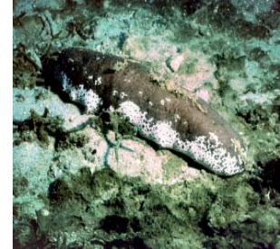
Holothuria fuscogilva White teatfish (Huhuvalu Hinehina)