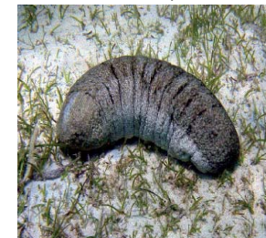
Holothuria scabra Sandfish (Nga'ito)