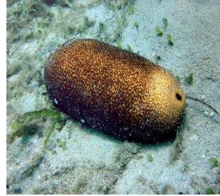
Bohadschia vitiensis Brown sandfish (Mula)