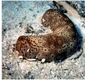
Bohadschia argus Leopardfish (Matamata)