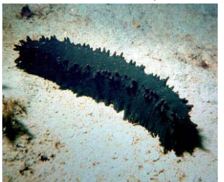
Stichopus chloronotus Greenfish (Holomumu)