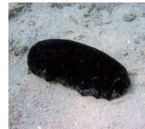
Holothuria whitmaei Black teatfish (Huhuvalu)