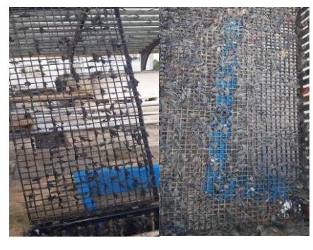
3. Install of new cage culture system